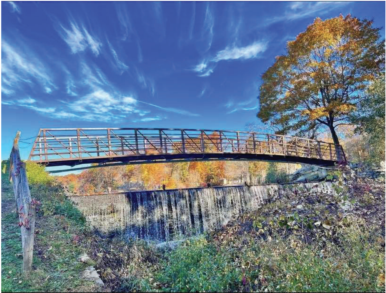
Governor Noffe Park