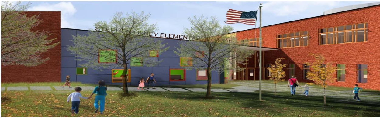
Stephen Olney Elementary School