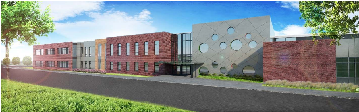
James L. McGuire Elementary School